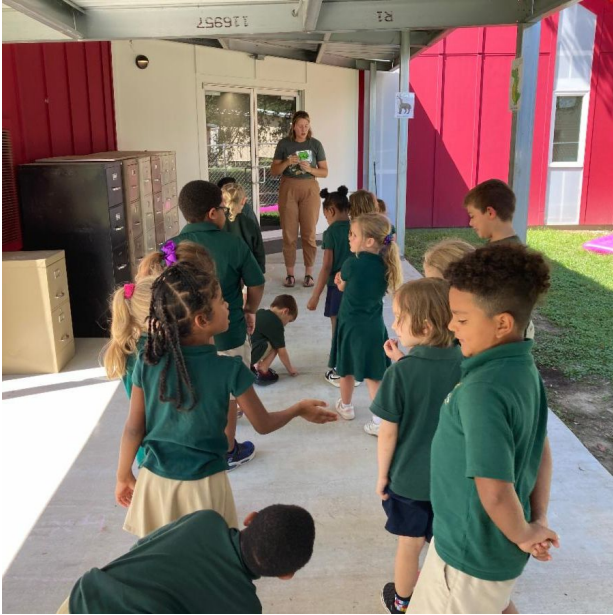
Mme Yaëlle's 1st Graders play a syllables game outside.

parent portal. If you need help setting up an account, please contact us. If you have changed your phone or your phone number and can no longer access your account, please contact Klassly.