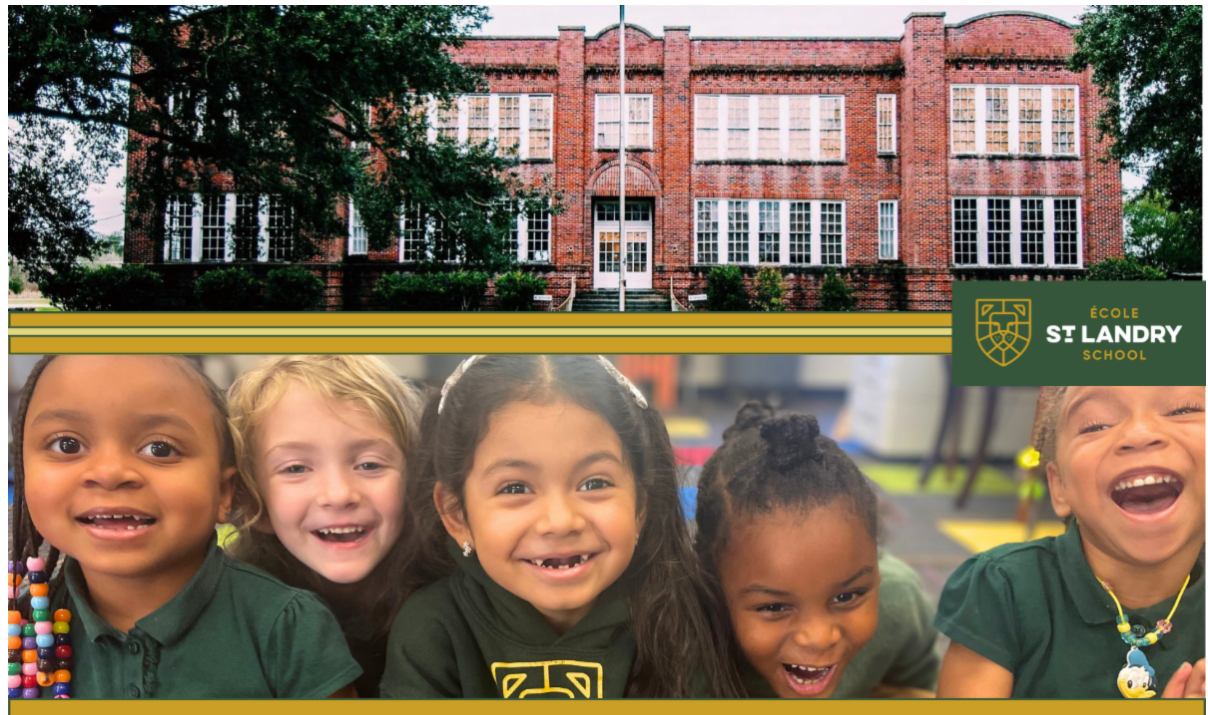
inspired by our past • empowered by our identity • prepared for our future

Saturday, November 2, 2024 Fête de la chaudière noire École Saint-Landry's annual black pot cookoff fundraiser